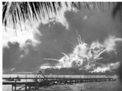
National Pearl Harbor Remembrance Day – December 7, 2025 Fly Your Flag at Half-Staff