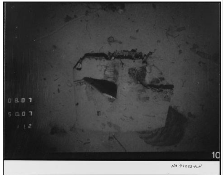
A view of the detached sail of the USS Scorpion on the ocean floor.

But Scorpion would never be heard from again. Three Theories, Zero Conclusions