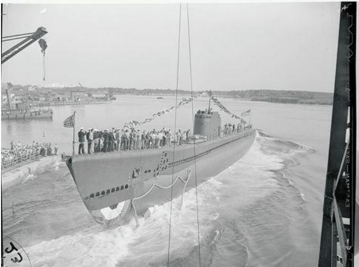
USS Scorpion was the sixth ship named “ Scorpion ” in the U.S. Navy. The fifth ship, also a submarine and pictured here in 1942, disappeared and was presumed sunk in 1944.

On May 20, 1968, the U.S. Navy ordered one of her fastest submarines, the USS Scorpion , to conduct a high-tech espionage mission. The submarine, fresh off maneuvers with the Sixth Fleet in the Mediterranean Sea, was diverted to