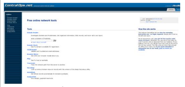
Here are the functions available:

Do you ever get an e-mail from an address you do not know, or seen scans on your system or router from an unknown IP address? There is a way to investigate, anonymously, to see who the source of the contact is. The site is known as <a href="https://centralops.net/co/">https://centralops.net/co/</a>.